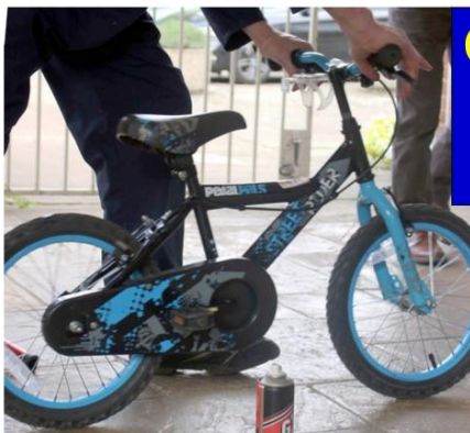
Check your bike