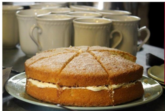
...and of course our café